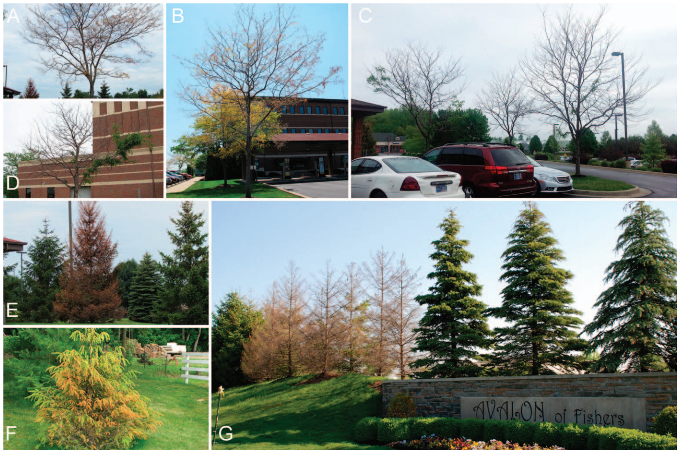
Figure 1. Injury from aminocyclopyrachlor at locations where tree samples were collected. Honey locust at location 1 with initial symptomology in July 2011 (A–B) and limited regrowth in May 2012 (C–D). Norway spruce injury at location 1 (E), location 2 (F), and location 3 (G). Photo E was taken in July 2011, photo F in June 2011, and photo G in May 2012. In photo G, notice the range of spruce injury from killed Norway spruce (left side of photo) where applications were made to turf on both sides of the tree and mild injury to Norway Spruce (right side of photo) where applications were made to turf on only one side of the tree (turf in background not visible) because of a mulched landscape bed without turf immediately in front of the trees and behind the neighborhood entrance sign. Samples were collected from damaged trees at each of these different locations and used to create the various wood chip lots for this experiment. (Color for this figure is available in the online version of this paper.)

damaged trees were Norway spruce [ Picea abies (L.) Karst.], Colorado blue spruce ( Picea pungens Engelm.), honey locust ( Gleditsia triacanthos L.), and eastern white pine ( Pinus strobus L.); however, many other tree and shrub species were also affected (Ruhl 2012).