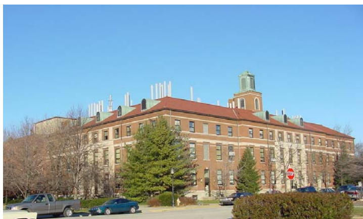
Biochemistry Building 175 S. University Street, Purdue University West Lafayette, IN 47907

The Office of Indiana State Chemist and Seed Commissioner (OISC) is located on the campus of Purdue University and housed in the Biochemistry Building in the College of Agriculture. This proximity to faculty, researchers and extension staff in the various agricultural sciences is beneficial in providing information on new technologies constantly emerging in the regulated industries OISC comes in contact with.