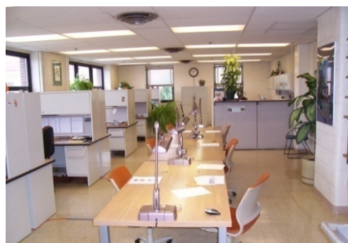
State Seed Laboratory, Today

Seed testing facilities were established at Purdue University following passage of that first law to provide support to enforcement activities conducted under the authority of the law. Testing services were also provided for residents and consumers of the state to assess seed quality on seed purchased and grown by farmers.