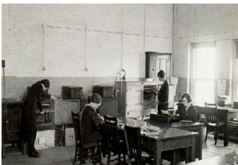
State Seed Laboratory, 1921

The Indiana Seed Commissioner was established in 1921 with the passage of House Bill No. 99 which was signed into law on February 24, 1921 to create the Indiana Seed Law, a “truth-in-labeling” law.