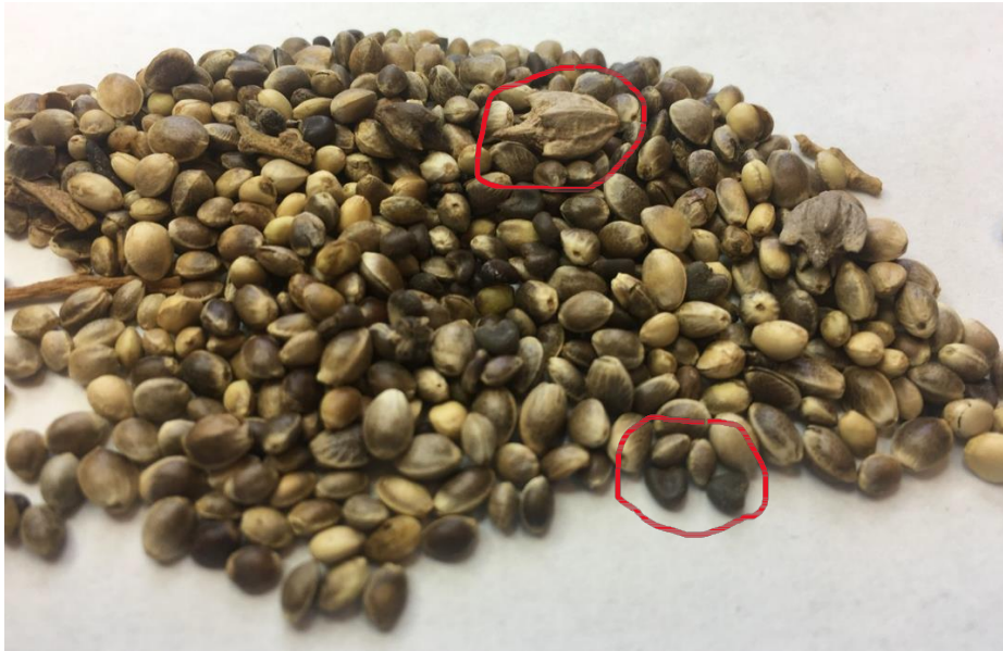
Fig 5. Example of weed seeds in a hemp sample. Red circles indicate weed seeds.