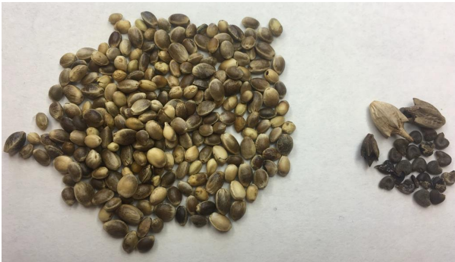
Fig 6. Example of weed seeds separated from pure seed.