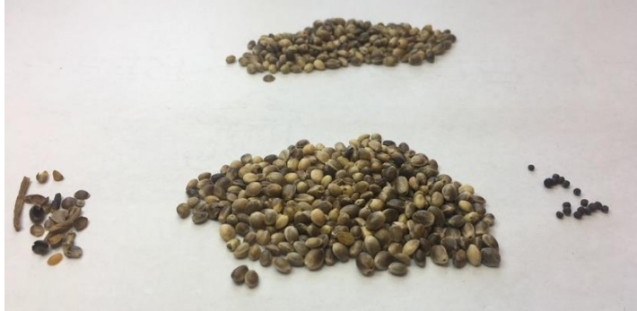
Fig 1. A purity being done on a hemp sample, all components must be separated to verify the claims.

A lot of seed is made out of pure seed components, pure seed unit, other crop and weed seeds. All of the seed components percentages including inert matter must add up to 100%. The pure seed components are done by percentage of weight. According to AOSA Rules for Testing Seeds, a pure seed is “fifty percent of the seed still regardless if an embryo is present.”