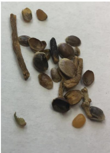
Fig 4. Example of inert matter commonly found in hemp.

Inert matter is anything in the lot that is not a seed, or seeds that will not grow such as ergotized seed. Every seed lot will contain inert matter and should be added to the label by percentage of weight 10 .