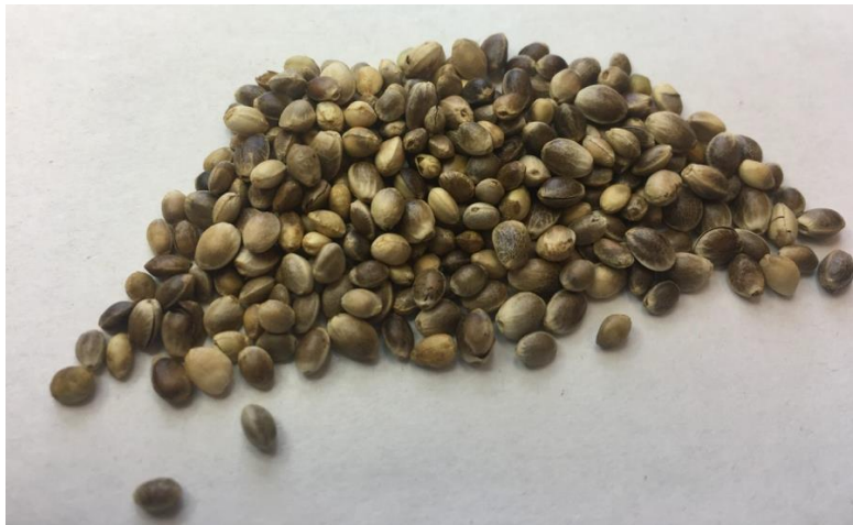
Fig 2. Pure hemp seed.