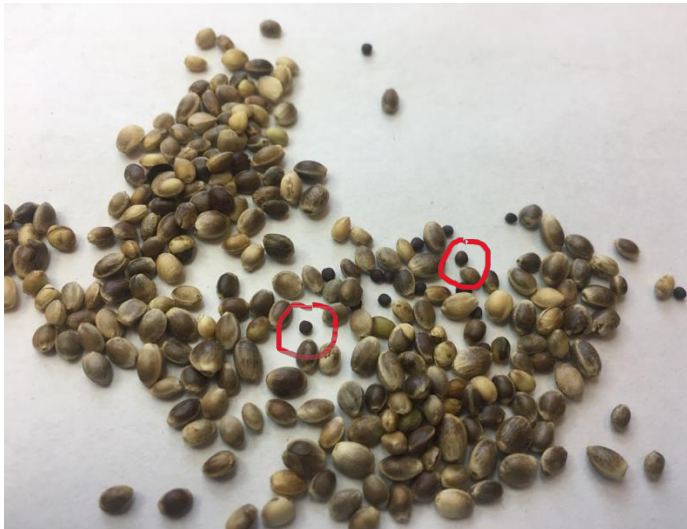
Fig 3. Example of other crop seed in hemp seed. The red circles indicate other crop seed.